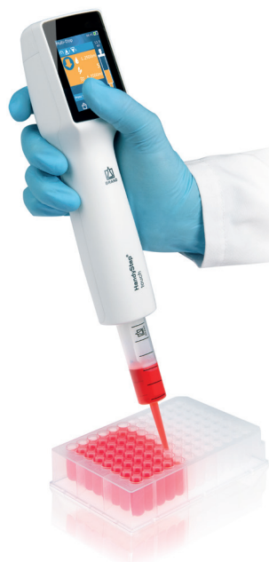
Multi dispensing with the HandyStep® touch and PD-Tip™ //

The HandyStep® touch saves time and prevents errors through automatic tip size recognition of the PD-Tip™ // from BRAND®, with patented coding on the pistons. After inserting the tip, the size is automatically recognized and displayed, making it easy to select the volume to be dispensed. When a new PD-Tip™ // of the same size is inserted, all instrument settings are maintained.