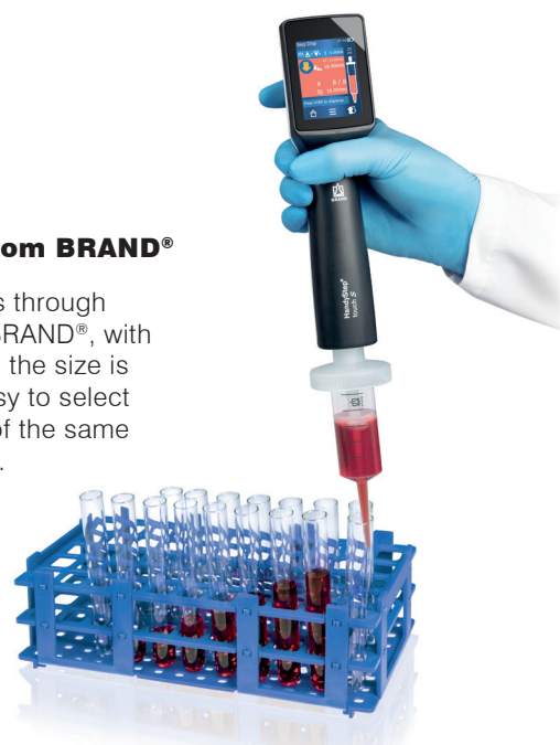
Sequential dispensing with the HandyStep® touch S and PD-Tip™ //